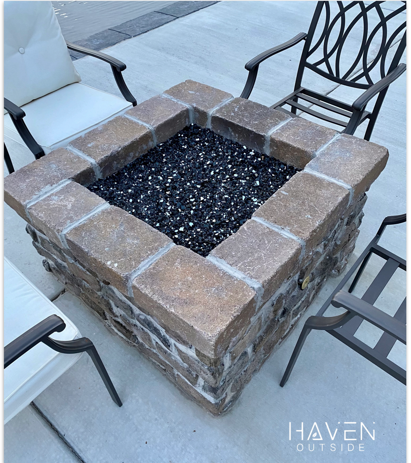
Haven Outside Example of Automated Pool System "Cadillac System"