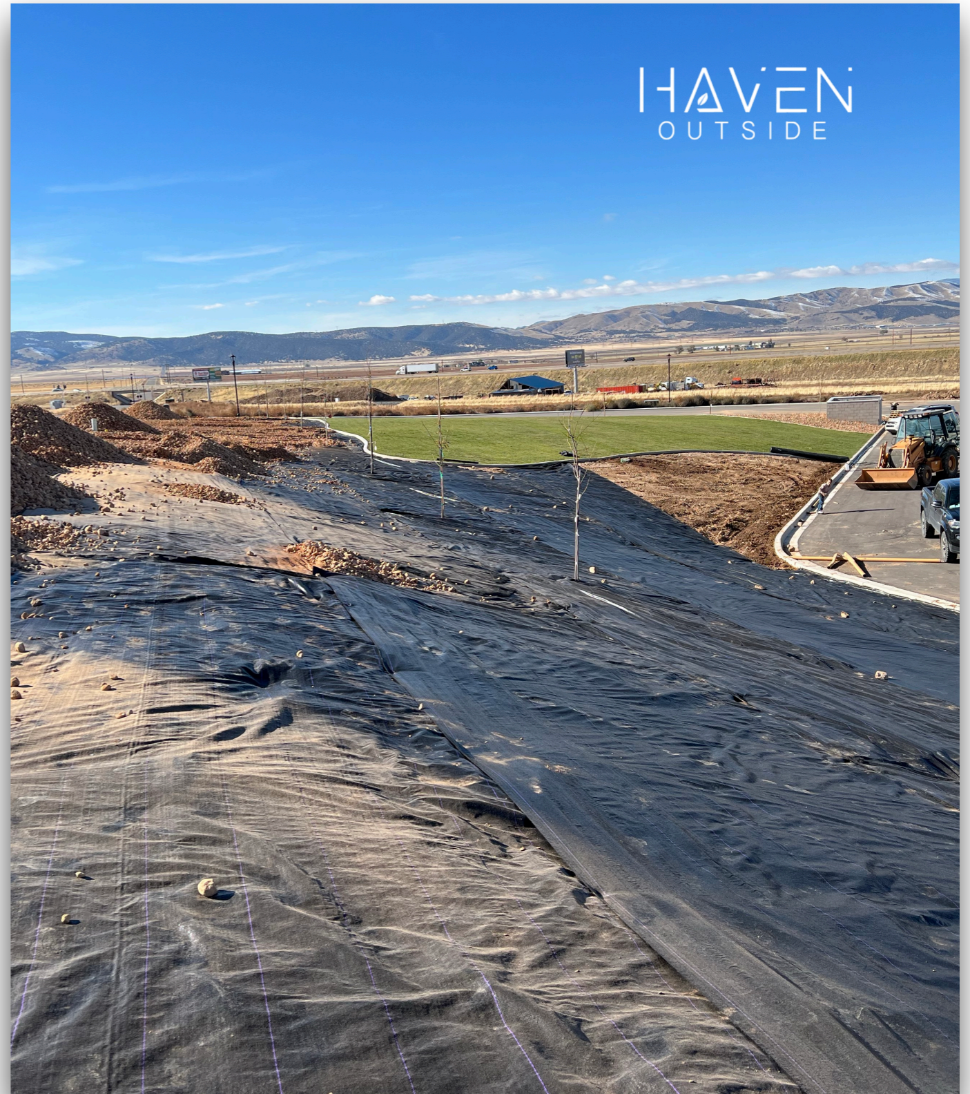
Large Swim Spa Haven Outside