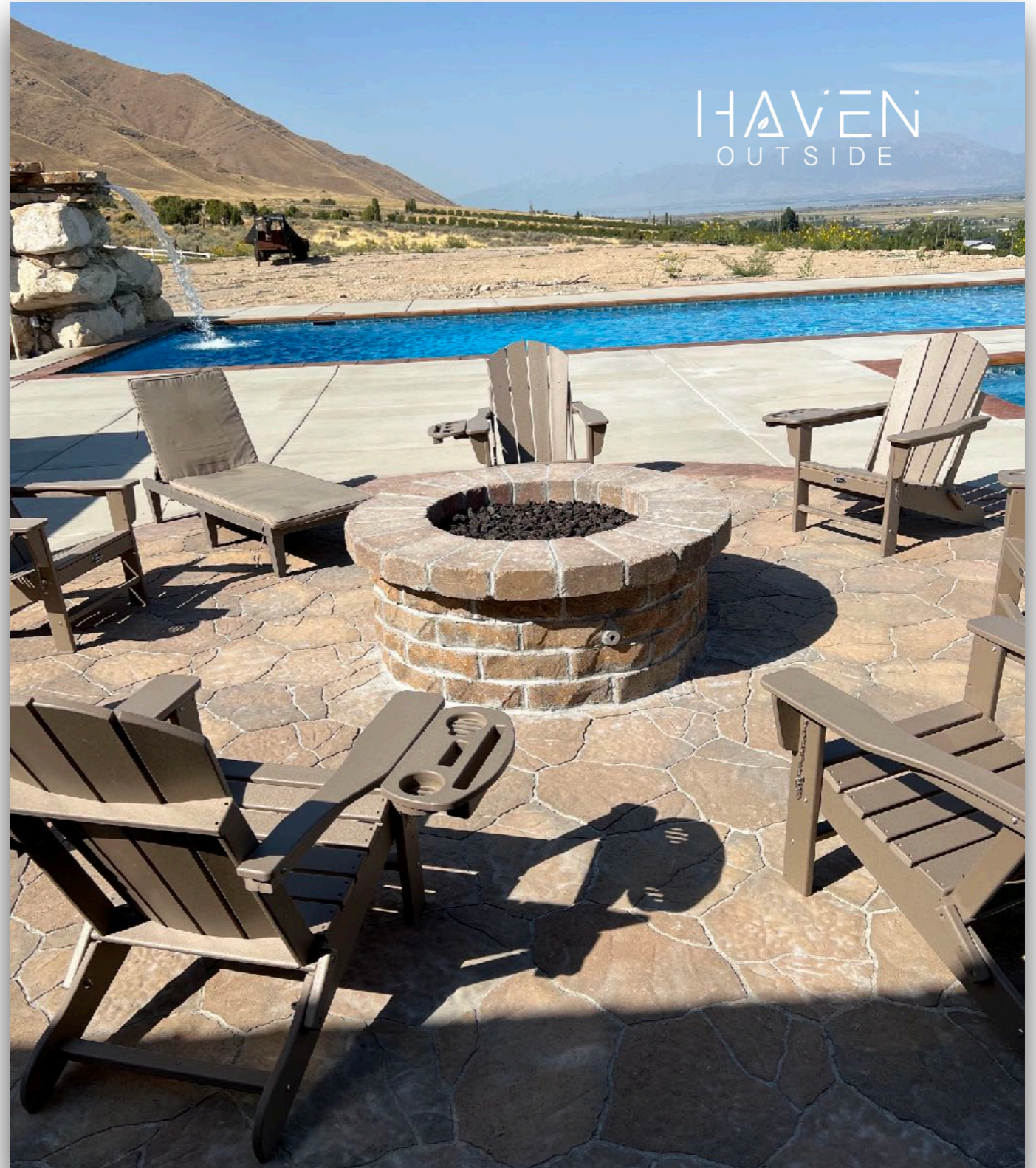
Pool-Side Fire Pit By. Haven Outside

Tip: Not always is additional prep work needed when building your pool but it's nice to plan ahead ensuring everything's done right.