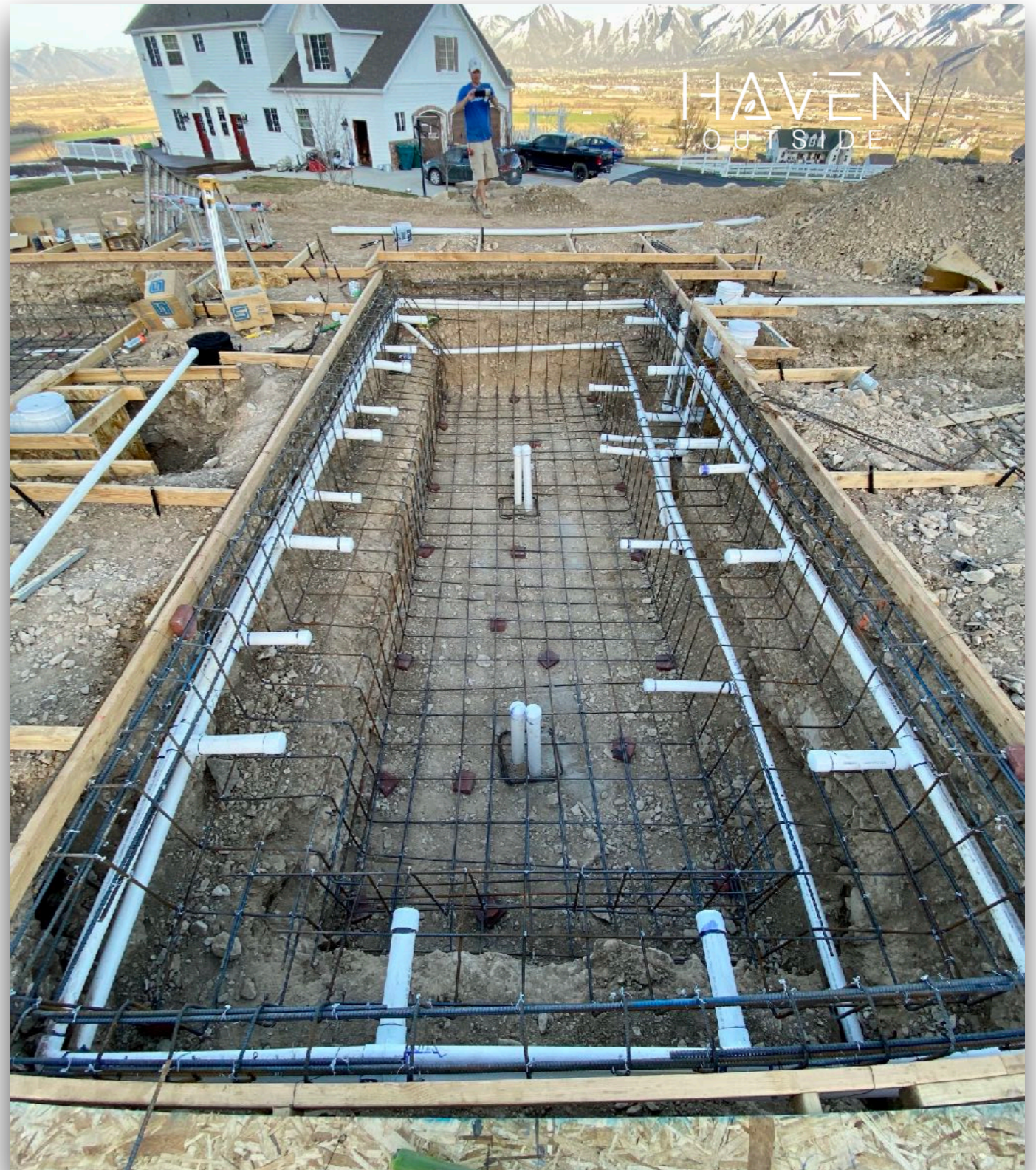
Large Swim Spa Haven Outside