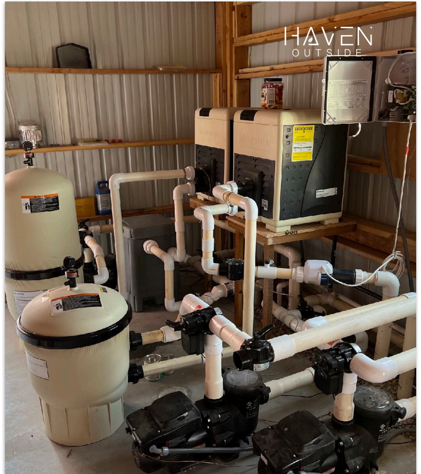
Haven Outside Example of Automated Pool System "Cadillac System"

Automation of chlorine generation, actuators, smart system control screens, automated water features and lighting, ozone cleaners, wifi connectivity and much more.