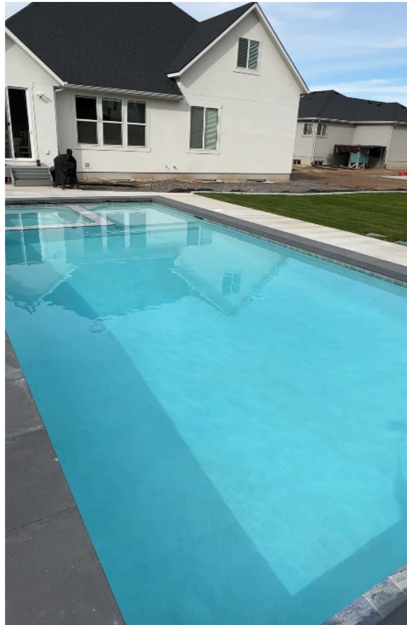
Beautiful sports poolspa with 8x8 in pool spa and finished back yard. By. Haven Outside